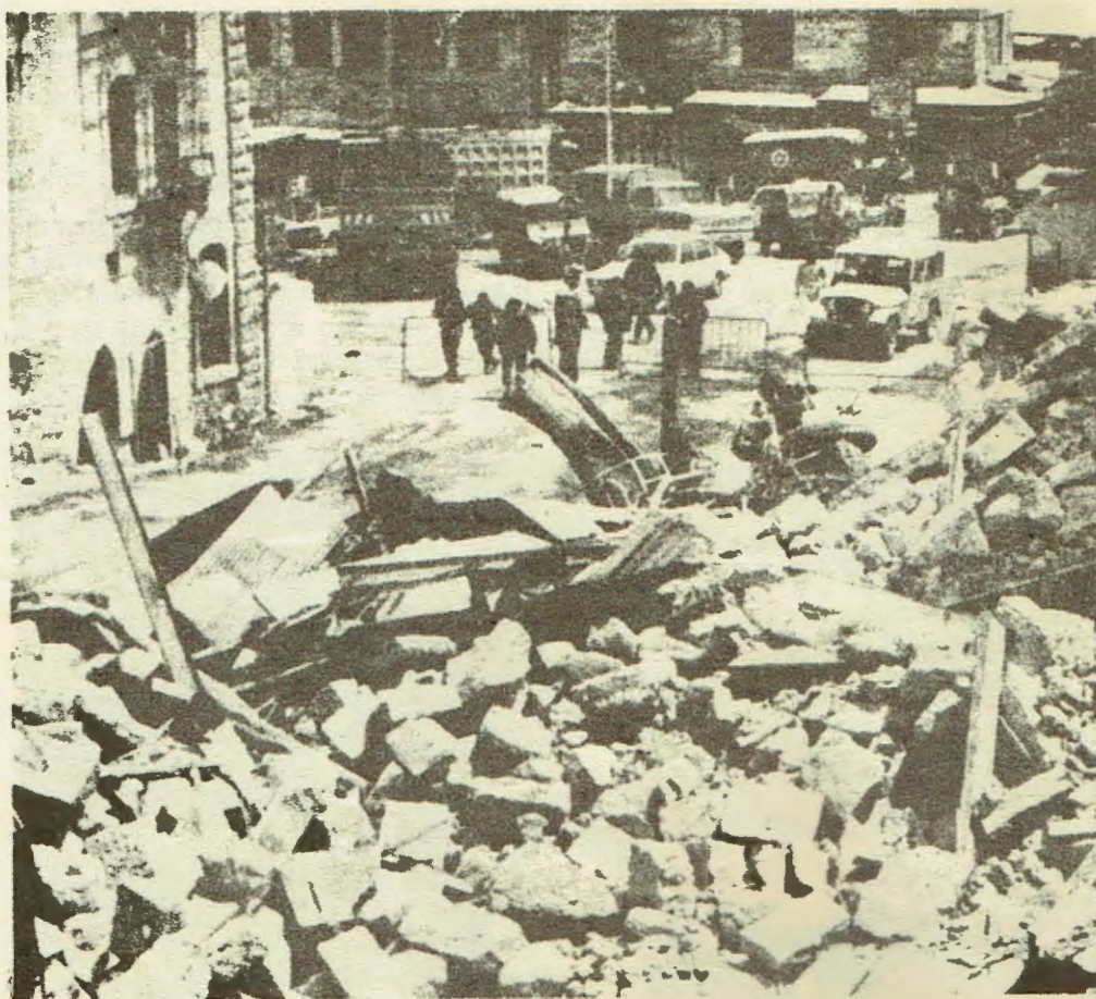
Houses destroyed by the occupation forces following the May 2nd operation

"The imperialist, Zionist and Sadat alliance safeguards not only the imperialist inter-